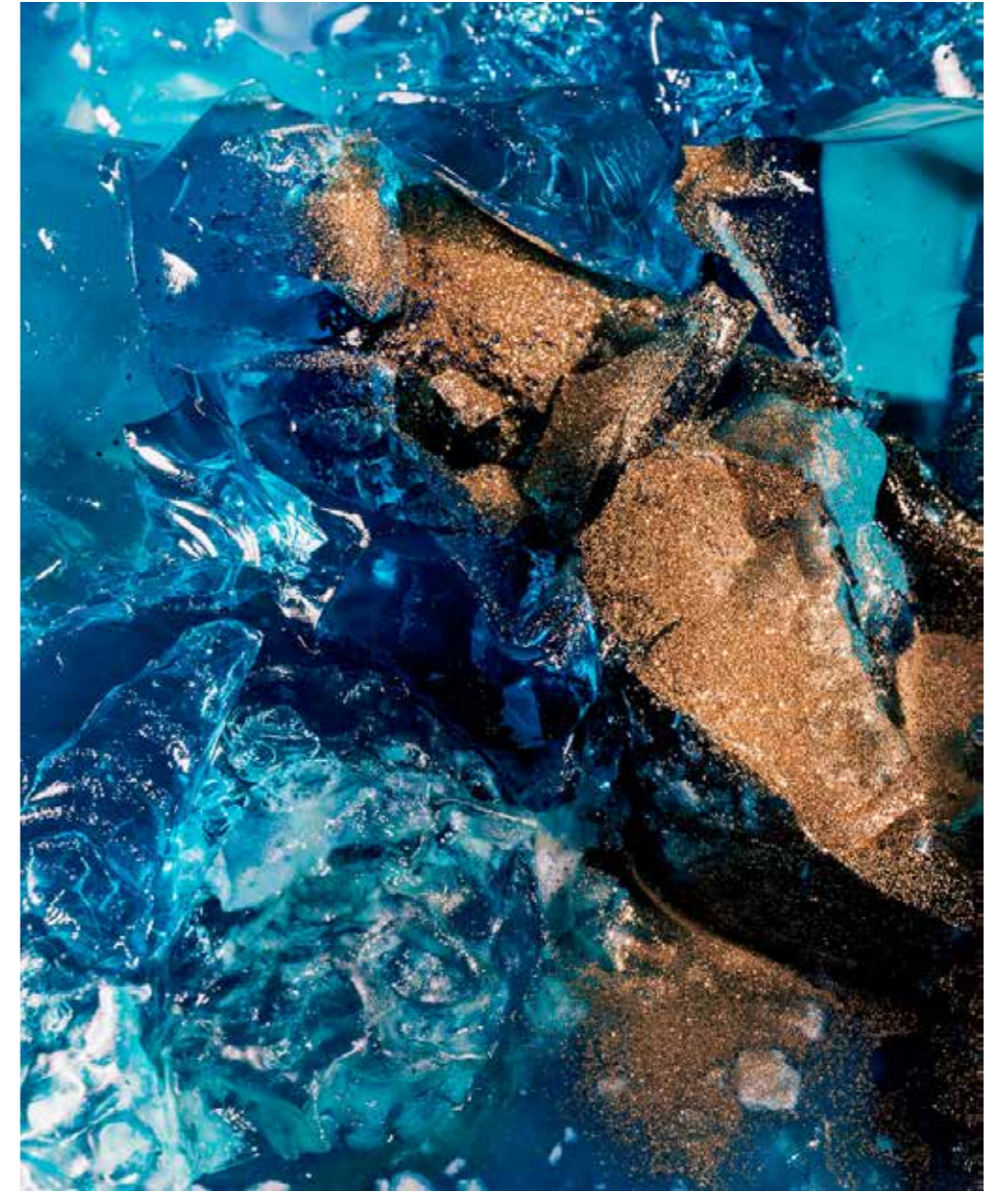
[06] Forbidden Colours (Blue) 02-08, medium-format film printed on Fuji Crystal Pearl, 75 x 100 cm, 2019.